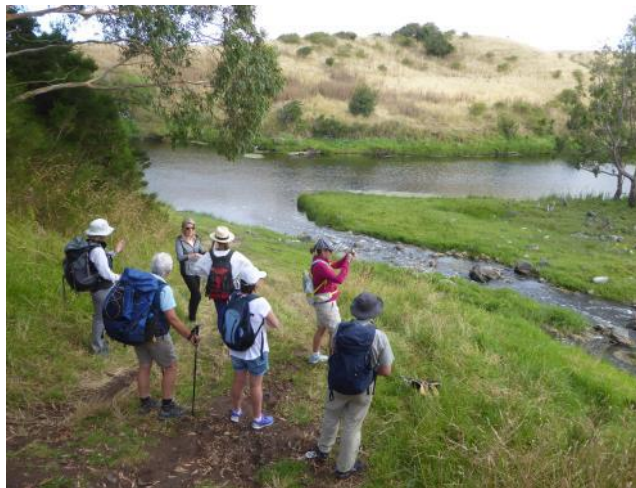
The Hopkins River at its junction with Mount Emu Creek, upstream as seen from the bridge, and at the Falls.

Returning to Hopkins Falls Road, we walked along it until we reached the bridge over the Hopkins River and proceeded into the Hopkins Falls carpark where we again admired the view. The waterfall was flowing reasonably well despite being mid-summer. There were two girls swimming in the pool below the falls.