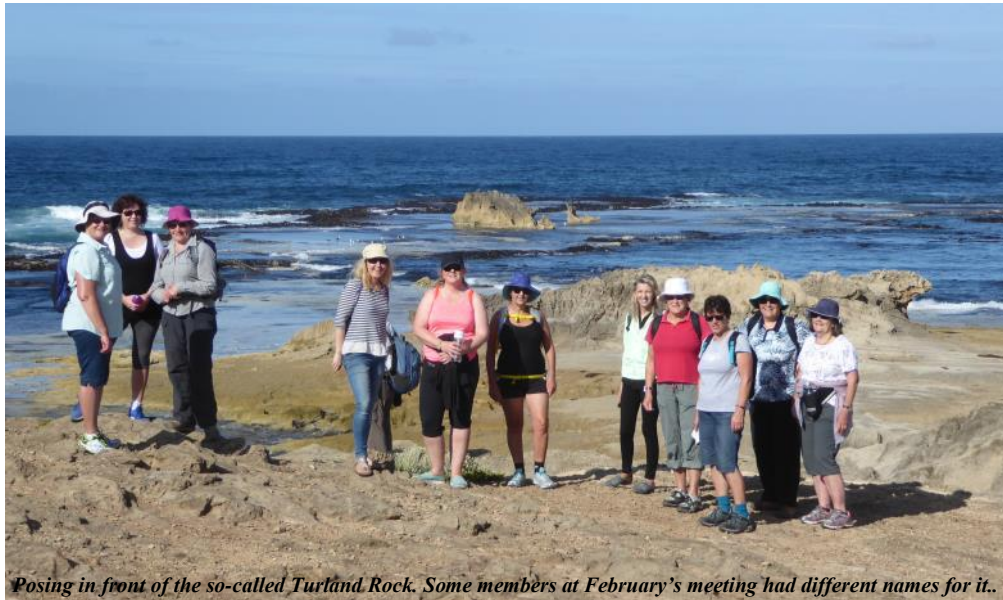
Posing in front of the so-called Turland Rock. Some members at February's meeting had different names for it..