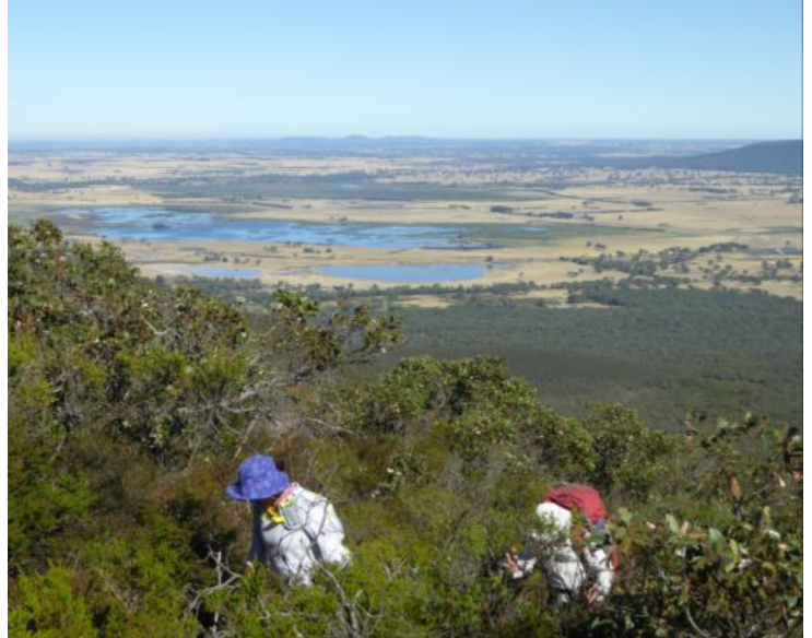
(Above) the Victoria Valley still had some of its October flood water (below).