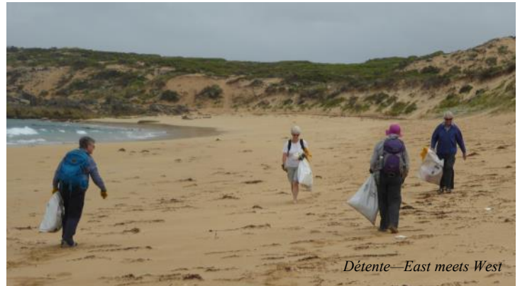
Détente—East meets West