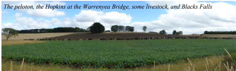
The peloton, the Hopkins at the Warrenyea Bridge, some livestock, and Blacks Falls